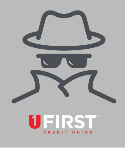
From idenity theft & financial fraud

Remember, UFirst Credit Union will never ask for your username, password, PIN, or for your full Social Security Number. Never share your account or personal information with someone you are not certain is legitimate. If you are uncertain about a person you are speaking with, stop communication and verify. If you feel your information has been compromised, please contact us at 801-481-8800.